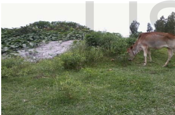
Fig. 3. Fly ash and bottom ash covering the soil and root of the plants.

Overall \text{Na}^+ , \text{Mg}^{2+} , \text{Zn}^{2+} , \text{Ca}^{2+} and \text{K}^+ are slightly varied from sample to sample besides a comparative deficiency in N, P and S content is yielded. Also, a considerable amount of As concentration which determined in a paddy field near the power plant (sample six) may be the evidence of the pollution of soil qualities which would be an indicator for reducing the soil fertility and productivity of the crops in future. On the other hand, the direct evidence of soil contamination is noticed during field observation because of improper dumping of the coal fly ash. Considering these points, it can be concluded that the improper dumping of coal fly or bottom ash from coal based thermal power plant can make a long-term negative impact on the soil environment as well as on the environmental chain as a whole. At the end, this research recommends for a suitable management plan for fly ash