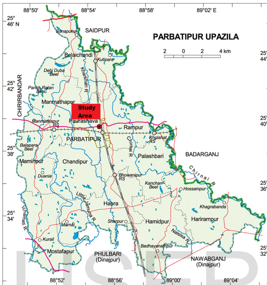
Fig. 1. Location map of the BTTP, Bangladesh.